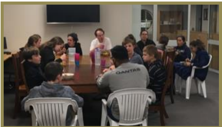
Last week's gathering of our 'Fusion' youth group, led by members of our Young Adult's Group.

To find out more please contact our Parish School: P. 9416 7200 E. info@holyfamily.nsw.edu.au W. www.hfldbb.catholic.edu.au